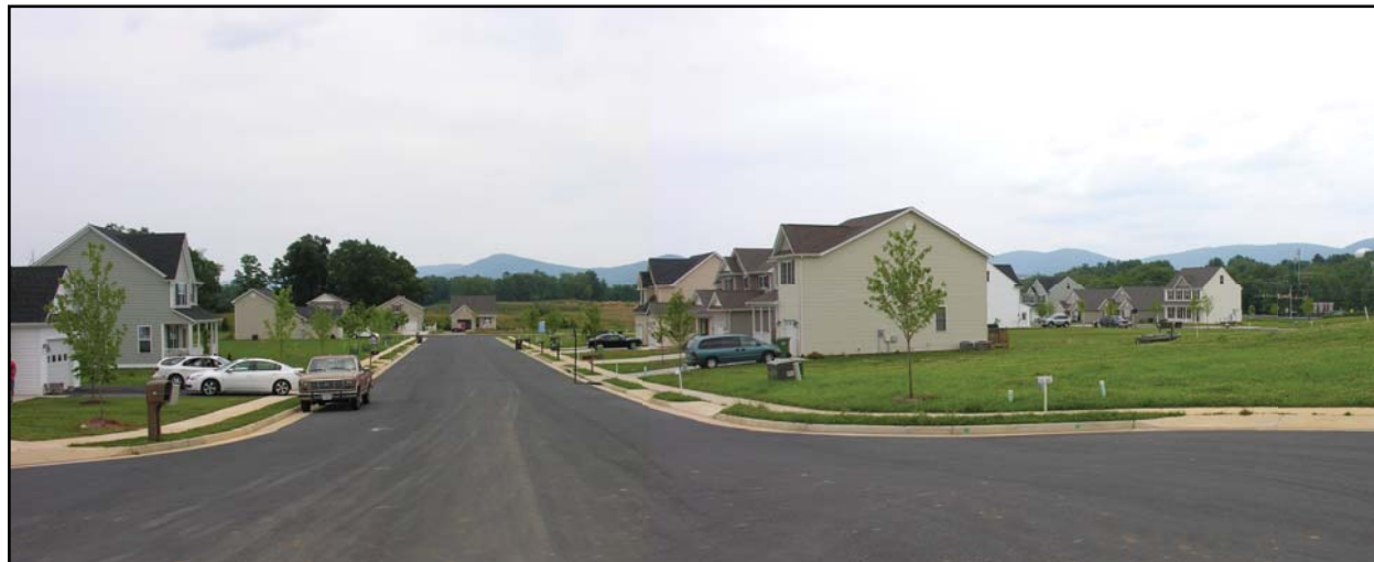
View of Section 1 from the cul-de-sac on Forever Court

Waynesboro Tax Rate: 70¢ per $100 of assessed value Schools: Waynesboro High Kate Collins Middle William Perry Elementary Electric: Dominion Phone: Ntelos Cable: Comcast Water and Sewer: Waynesboro Public Works Hook up fees: Water = $2,725 Sewer = $4,250